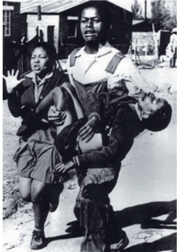
The iconic photograph of Hector Pieteron, fatally injured in the Soweto uprising.

However, in an ironic twist, the close links between government, judiciary and the private sector have scuppered their attempts to sabotage the lawsuit. Federal law requires at least six of the nine Supreme Court justices to hear review cases. But four of them have been forced to withdraw because of 'conflicts of interest': they all have financial or personal connections with some of the companies on trial, including Nestlé, Hewlett-Packard and the Bank of America. One of the judges, Samuel Alito, is a particular favourite of George W Bush. In 2005 Bush nominated him for the